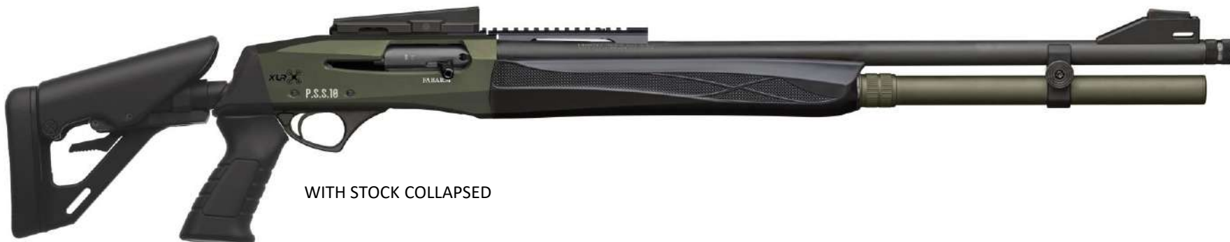
WITH STOCK COLLAPSED